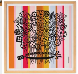
RIGHT: A close-up of the Bouquet pattern

GRAPHIC CONTENT In the brand's own words, Herman Miller has "opened its vault" to release a series of posters featuring the graphics created by mid-century modern designer Alexander Girard for the Girard Environmental Enrichment Panels, a group of decorative silkscreen designs released in 1972 to liven up office environments. Varying in theme and size, the patterns include everything from heart shapes to eyes. The posters recreate the imagery on cotton paper framed in American maple with a natural white or black finish. hermanmiller.com