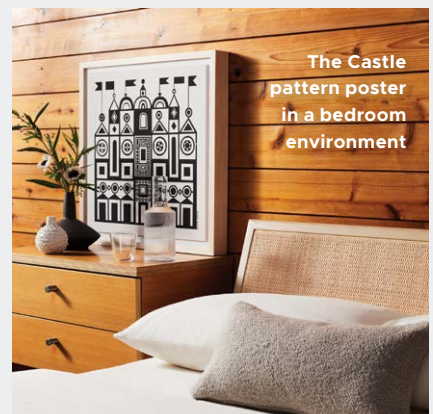
The Castle pattern poster in a bedroom environment

GRAPHIC CONTENT In the brand's own words, Herman Miller has "opened its vault" to release a series of posters featuring the graphics created by mid-century modern designer Alexander Girard for the Girard Environmental Enrichment Panels, a group of decorative silkscreen designs released in 1972 to liven up office environments. Varying in theme and size, the patterns include everything from heart shapes to eyes. The posters recreate the imagery on cotton paper framed in American maple with a natural white or black finish. hermanmiller.com