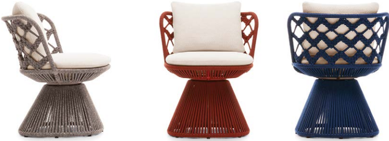
ABOVE: Available in various colors, the Flair O'Chair is designed with a backrest woven on a special circular loom.