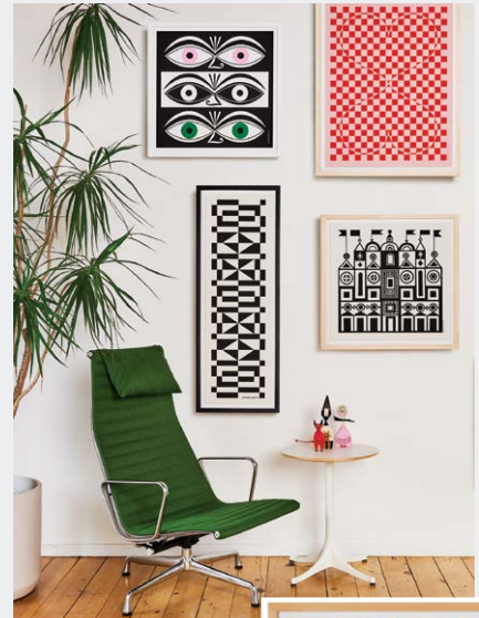
ABOVE: Four of the Girard posters arranged together as they would have been in a 1970s-era office